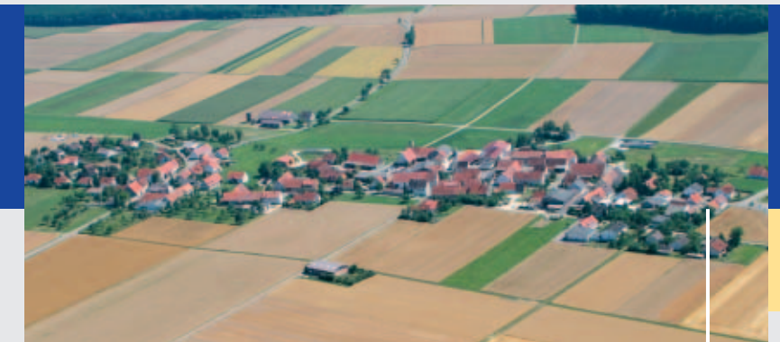
The sub-district Sachsenhausen

Giengen offers its inhabitants everything required to lead a pleasant life.