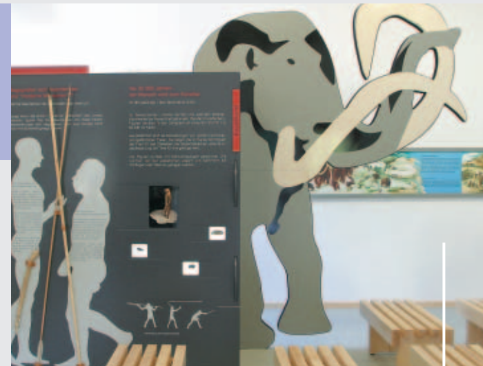
The "HöhlenHaus" offering interesting information about the history of the earth and the archaeological finds in the Lonetal caves.