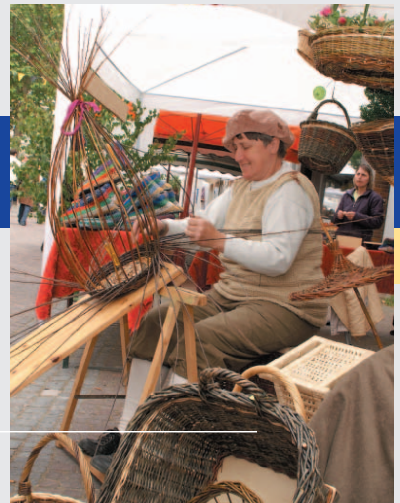
The Giengen free city market is famous across the region. Old and new stand side by side.