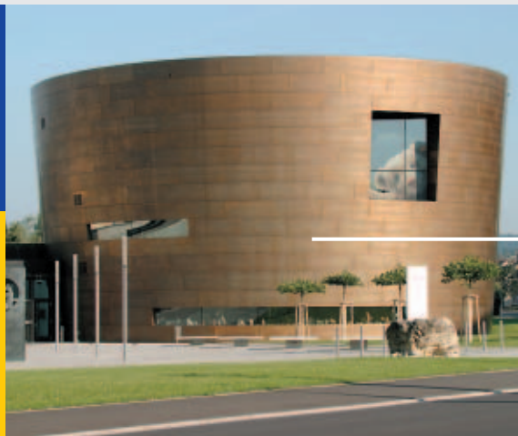
The "Welt von Steiff" provides its small and big guests with an unforgettable experience.