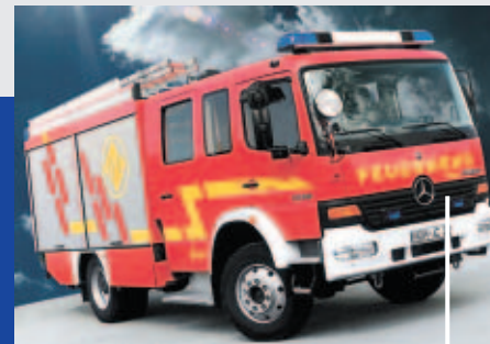
A Ziegler fire-engine

More than 80 different uses: felt from the "Vereinigte Filzfabriken AG".