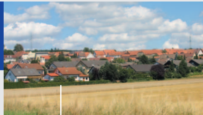
The sub-district Hohenmemmingen