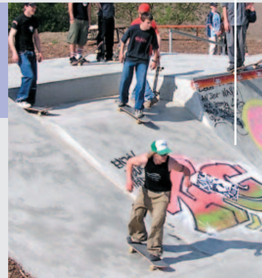
In the skater park young people demonstrate their artistic "grinds".